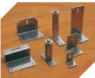
Easy Feet™, Power Post™ and "L" Feet Supports