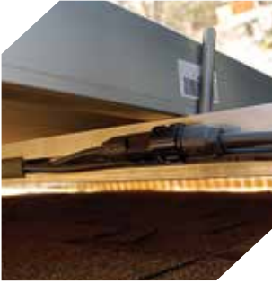
Cable Management in Rails

The top-clamping PV module mounting system is engineered to reduce installation costs and provide maximum strength for parallel-to-roof or tilt up mounting applications.