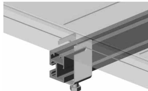
P6 Universal End Clamp

Refer to the Power Rail Catalog at www.dpwsolar.com for all roof attachments and clamping options.