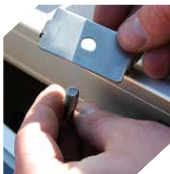
Lock-In-Place RAD Bolt